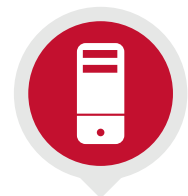
Secure Software and Data Centre