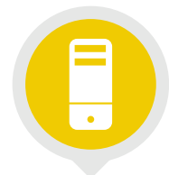
Secure Software and Data Centre