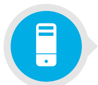
Secure Software and Data Centre